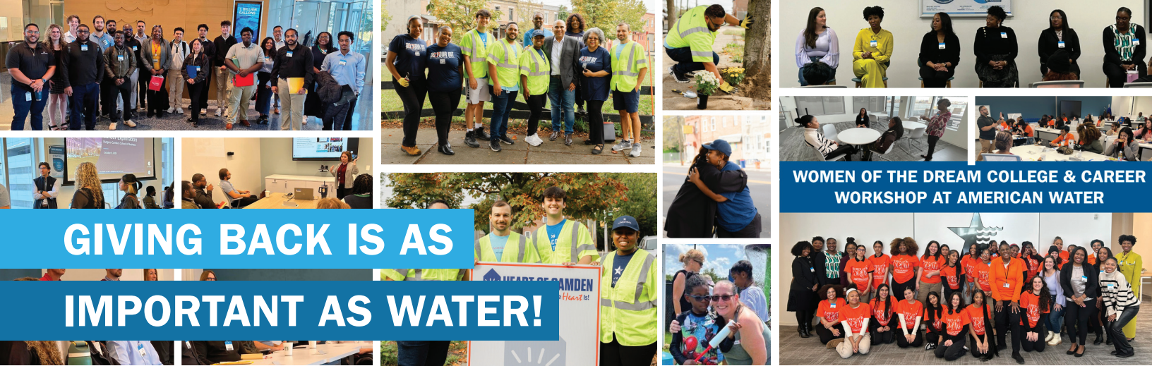
WOMEN OF THE DREAM COLLEGE & CAREER WORKSHOP AT AMERICAN WATER